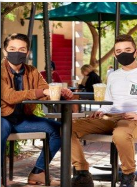
Starbucks News @StarbucksNews · Mar 18 A $5 million investment from The Starbucks Foundation will support nonprofits focused on programs that advance equity and inclusion for BIPOC youth.